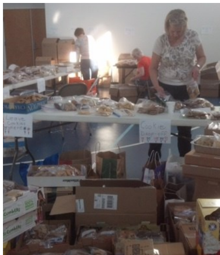
Constructing a prayer chain and sorting cookies prior to going in to Fluvanna Correctional Center for Women for the Kairos weekend.